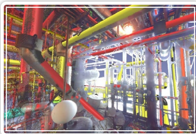
EdgeWise was able to accurately extract and model nearly 70% of the scanned pipes.

High definition laser scanning was a new technology for the owners and operators of the chemical facility. The team spent extra time at the beginning of the project to teach the client about laser scanning, its benefits, and its limitation to ensure that the expectation matched the final work product.