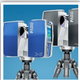
Faro Focus 3D